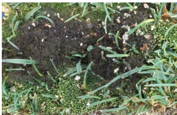
Figure 3. The same area shown in Figure 2, following incubation in the dark for 12 hours. The dark material is an unidentified blue-green algae that occurs in association with the moss, B. argenteum .

when light intensity decreases. There is some sketchy evidence that the algae and the moss have a symbiotic relationship, where the algae benefits the moss by fixing nitrogen, and the moss benefits the algae by secreting nutrients that are essential to the moss. The results of our tests (see below), which indicate that control of the algae results in control of the moss, also supports the concept of a close dependency between the moss and the algae. More research is needed, however, to confirm the nature and the frequency of this very interesting interaction.