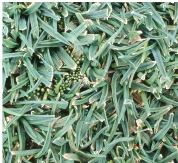
Figure 1. Close-up of a moderate moss infestation.

When turf is heavily infested with B. argenteum , moss plants may outnumber turf plants (Figure 2), and the area, when viewed from a distance, can take on a silvery appearance, as shown in Figure 5—thus the name, silvery thread moss. However, don't wait to see this symptom before acting, since it occurs only after moss infestations are very serious.