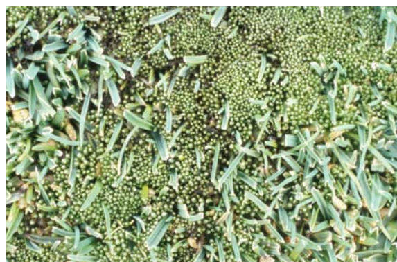
Figure 2. Close-up of a heavy moss infestation.

When turf is heavily infested with B. argenteum , moss plants may outnumber turf plants (Figure 2), and the area, when viewed from a distance, can take on a silvery appearance, as shown in Figure 5—thus the name, silvery thread moss. However, don't wait to see this symptom before acting, since it occurs only after moss infestations are very serious.