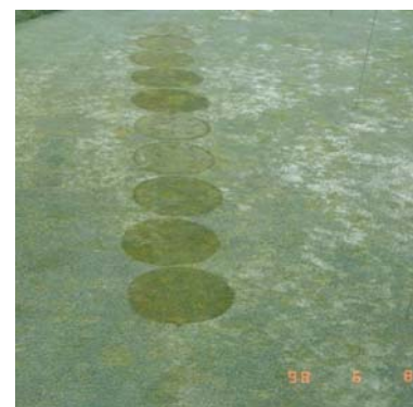
Figure 5. Test area following application of UltraDawn dishwashing detergent, June 8, 1998. Each circle represents one of eleven treatments tested. Note also the heavy moss infestation (gray or silvery patches) occurring around the plot area.

were used, UltraDawn provided excellent, long lasting control (10 weeks or more of control, from a single application) of even the heaviest moss infestations. High volumes of application (80 gallons/1000 square feet or more) provided the best control, with the least amount of turf damage, when UltraDawn was used at a rate of 4 oz/gallon. At these volumes, the turf is treated in a drench fashion, as opposed to the very light, almost invisible spray coverage that is typically seen with broadcast applications. At lower application volumes (less than 40 gallons/1000 square feet) almost no moss control was observed (Table 2, figure 6).