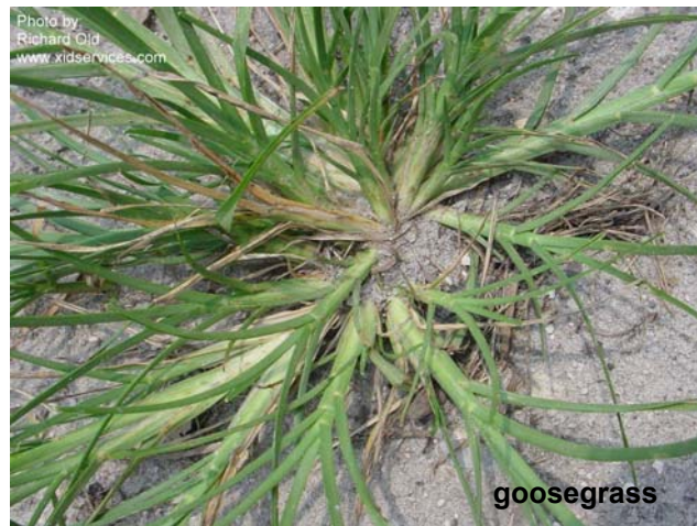
Photos of goosegrass and white clover courtesy of WSSA and XID Services, Inc. Photo of nutsedge courtesy of Bruce Kidd, Dow Agro.

product for your turf types. University trials conducted in the past several years indicate that foramsulfuron (Revolver) – a product recently registered for removal of perennial ryegrass on warm season fairways – has excellent post-emergent control of goosegrass. Post-emergent control with other products such as MSMA, diclofop or fenoxaprop are also effective.