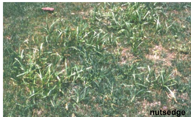
Figure 1. Purple and yellow nutsedge control with Monument (trifloxysulfuron), Manage (halosulfuron) and two experimental herbicides. Each product was applied once in May, and control values shown below represent the average of several ratings taken over a period of three months after application. Data courtesy of Dr. Fred Yelverton, North Carolina State University.

annua, as well as broadleaf weeds such as carpetweed, clover, dandelion, henbit, oxalis and spotted spurge. In addition, it can be used as a tool for removing perennial ryegrass and Poa trivialis from overseeded bermudagrass fairways. Monument is registered for use on bermudagrass and zoysiagrass.