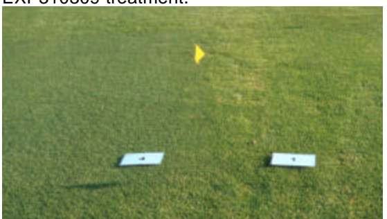
Figure 2. EXP310309 @ 5.0 oz/1000 sq ft (Treatment 5, left) vs. Chipco Proxy @ 10 oz/1000 sq ft (Treatment 3, right). 7/27/99. These treatments produced roughly the same level of turf quality and scalping.