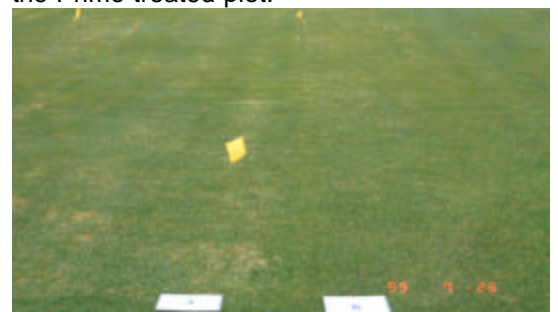
Figure 3. Proxy @10 oz/1000 sq ft (Treatment 3, left) vs. Primo L @0.5 oz/1000 sq ft (Treatment 6, right). 7/27/99. Note the lack of scalping in the Primo treated plot.