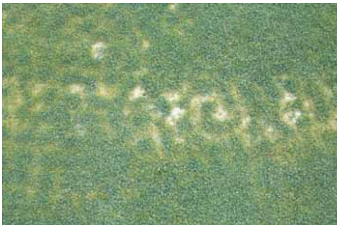
Figure 1. Problem area that is under investigation in this example. Note the green polka dot patterns of healthy turf, and the damaged surrounding turf.

Imagine that you are a superintendent who has noticed the worrisome symptom illustrated in Figure 1 below: small green polka dots of turf, about one-inch in diameter, throughout the low, heavily trafficked areas of your bentgrass green, surrounded by chlorotic (yellow) turf. You suspect that your high soil salt levels, combined with a recent fall aeration may be responsible, since these conditions frequently cause water to preferentially channel down the sand-filled aeration holes, instead of uniformly flowing through the entire soil profile. How would you test the hypothesis that there is no difference between the salt content (electrical conductivity) of the aeration hole sand vs. the soil between the aeration holes?