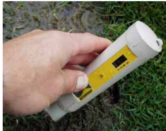
Figure 2. Field Scout EC meter used in experiment.

Materials and Methods: Three cup-cutter samples will be taken from the stressed area where the green polka-dot pattern is most apparent. A knife will be used to dig out the sand under the green polka dots, and the sand will be placed into a clean plastic container that has been labeled "HOLES". Similar samples will be collected from between aeration holes for comparison and placed in plastic containers labeled "BETWEEN HOLES". Water will be added to each sample until it is saturated. A Spectrum Field Scout EC meter will be used to measure electrical conductivity (EC), and values will be converted to saturated paste equivalent values using PACE Turf's Monitoring Salinity Reference.