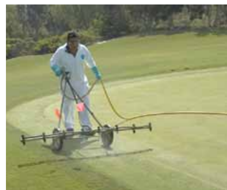
Walking boom sprayers are useful for application of fertilizers, pesticides and other products to small research plots. See page 6 for a listing of recommended research equipment and sources.