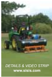
DETAILS & VIDEO STRIP www.sisis.com

The AER-AID moves air uniformly throughout the root zone for complete aeration of the entire area - not just where the lines have penetrated.